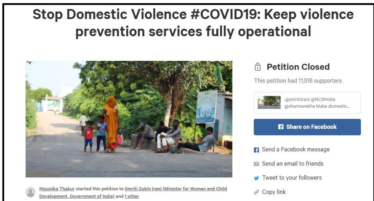
Image 3: Petition drawing attention to the issue of Domestic Violence

This petition, addressed to DWDC and NCW, outlined the issues of domestic violence and abuse faced by rural communities and proposed specific services to be made essential underlining the urgency of the situation.