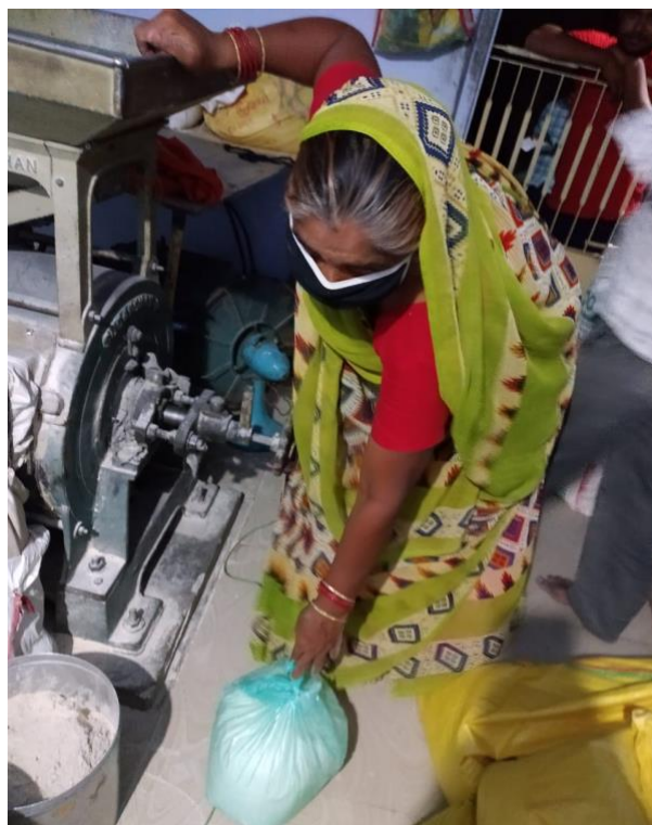
Image 2: Local small scale farmer and chakki owner – supplied wheat flour for food kits

Phase 2: For this, we went a step further to promote small-scale business and local produce. We also wanted to look at our efforts leading to the empowerment of women farmers. To this end, we identified a local woman farmer and bought her produce to be included in the ration kit for distribution. The woman also has a small scale flour mill and provided us the wheat flour of the grains purchased from her farms. 725 kilograms of wheat flour procured from a woman farmer in Upariyala village, Dasada block, Surendranagar district for ration kits which were distributed in the block.