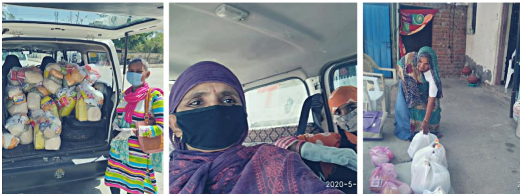
Image 2: SWATI Team distributing packages adhered to guidelines and social distancing norms at all times